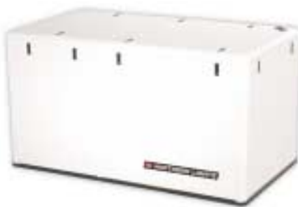
Sound Enclosure Dimensions – Length x Width x Height: 49.9 in x 27.2 in x 29.8 in (1267 mm x 691 mm x 757 mm)