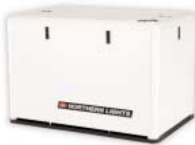
Sound Enclosure Dimensions – Length x Width x Height: 32.5 in x 21.2 in x 21.8 in (826 mm x 538 mm x 552 mm)