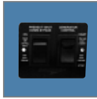
Length - 3.38" x Height - 2.88"