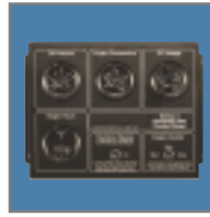
Length - 10" x Height - 8" x Depth - 4"

Includes: Run light, engine hourmeter, start/stop, and shutdown bypass/preheat switch.