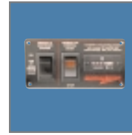
Length - 5.5" x Height - 2.88"

Includes: Run light, start/stop and shutdown bypass/preheat switch.