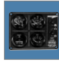
Length - 7" x Height - 5.25"